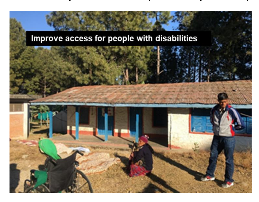
Figure 4: Improve access for people with disabilities

There are various buildings where access for people with disabilities is difficult (see Figure 4). The site needs to surveyed and works to improve mobility access implemented.