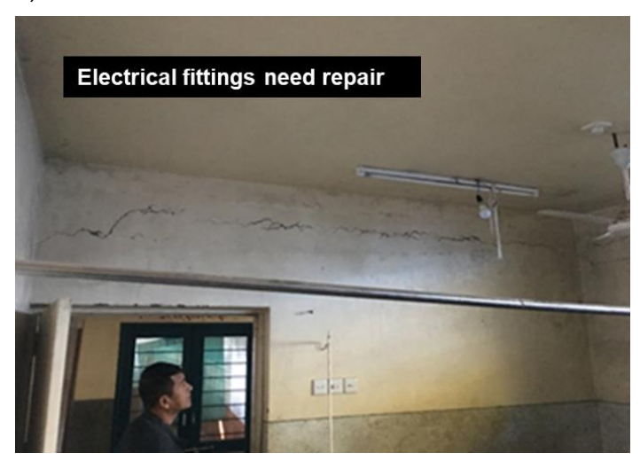
Figure 2: Broken electrical fittings and makeshift repairs

Hospital management and staff reported various difficulties and faults with the electricity supply, including power surges damaging equipment. Electrical fittings in a number of buildings also need repair (see Figure 2)